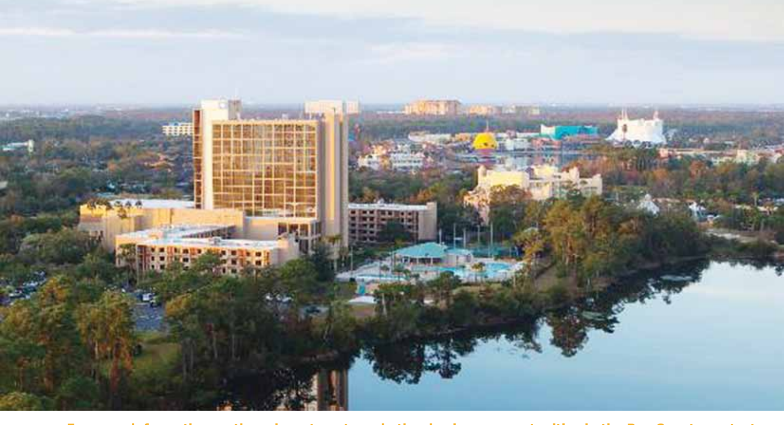
For more information on these investments and other business opportunities in the Bay County contact:

The Strategy and Delivery Unit Office of the Governor, Homabay County P.O BOX 469-40300, Homabay, Kenya